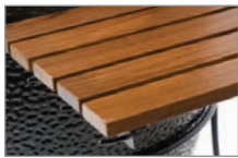
Teak Finished Solid Bamboo Side Shelves (Black Grill)