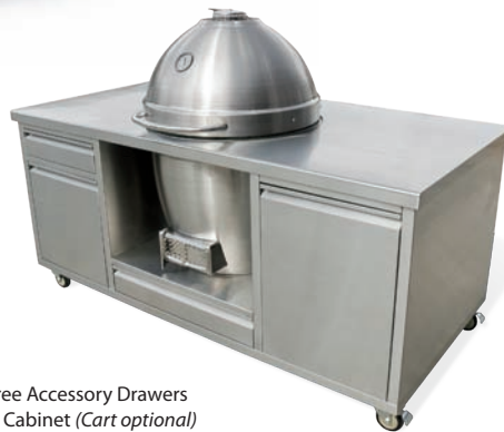
Pro Joe Cart with Three Accessory Drawers and Charcoal Storage Cabinet (Cart optional)