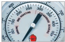
Extra Large Thermometer with Cooking Guide

Also Available in Red with Finished Natural Bamboo Side Shelves & Handle.