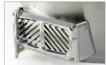
Investment Cast 304 Stainless Steel Draft Door with Mirror Finish