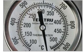
Extra Large Thermometer for Readability