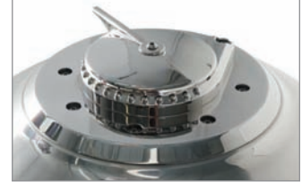
Investment Cast 304 Stainless Steel Top Vent with Mirror Finish