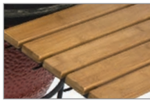
Natural Finished Solid Bamboo Side Shelves (Red Grill)