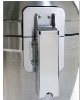
Perfectly Counterbalanced Hinge with Static Positioning as low as 10°