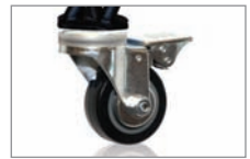
Oversized Locking Caster Wheels on Cart for Stability and Easy Movement